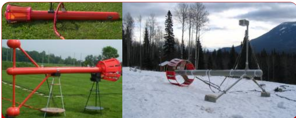
Magnetometer GSMP-35A(B), Vertical Gradiometer GSMP-35GA(B) and Tri-Axial Gradiometers GSMP-35GA3(B)

All of these technologies come complete with two year warranty.